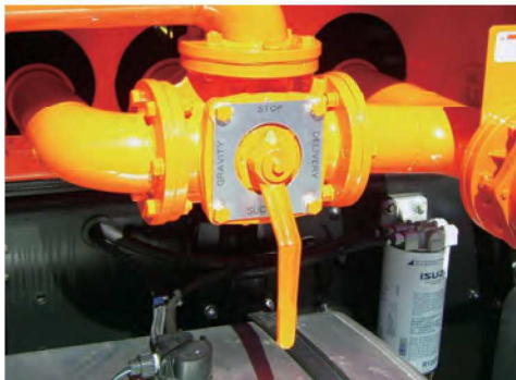
▲ 4-way cock