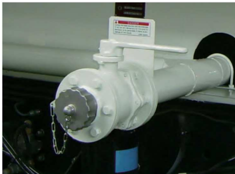
▲ 2-way cock