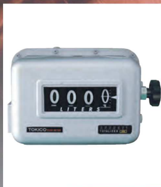
▲ Flow meter