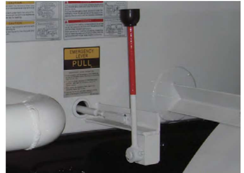
▲ Emergency valve control lever