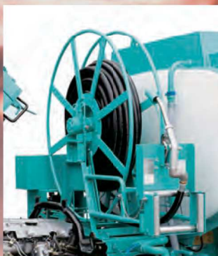
▲ Hose reel