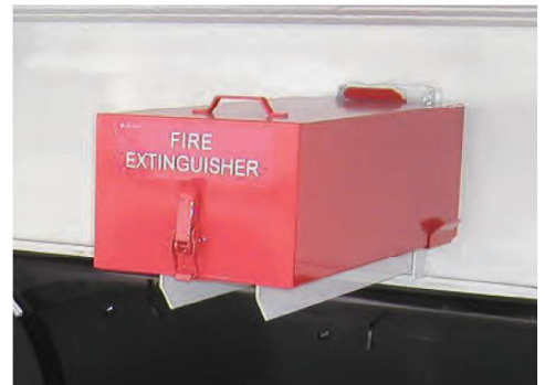
▲ Fire extinguisher

The vehicle in the photographs include optional equipments, special coloring and processing.