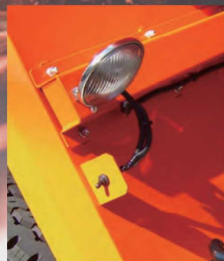
▲ Working lamp