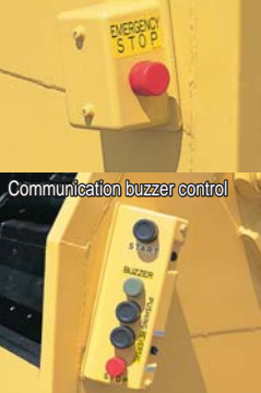
Communication buzzer control