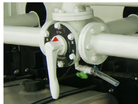
▲ 4-way cock