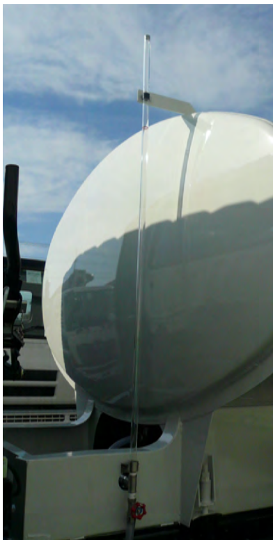
▲ Level gauge