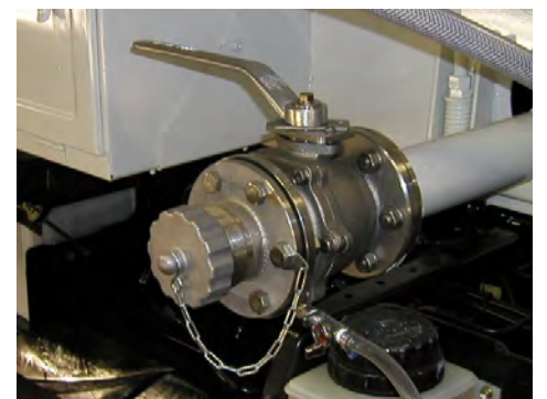
▲ 2-way cock

The vehicle in the photographs include optional equipments, special coloring and processing.