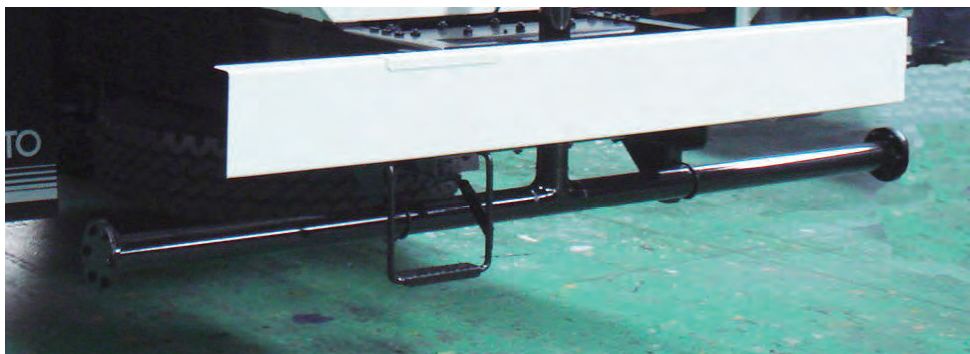
▲ Spray bar

The vehicle in the photographs include optional equipments, special coloring and processing.