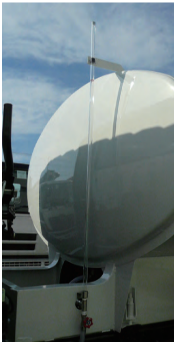
▲ Level gauge