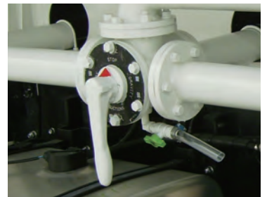
▲ 4-way cock