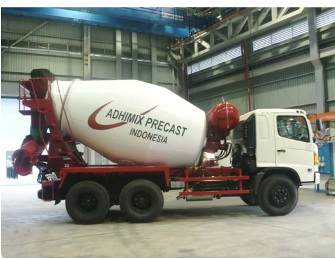
[Concrete mixer truck]