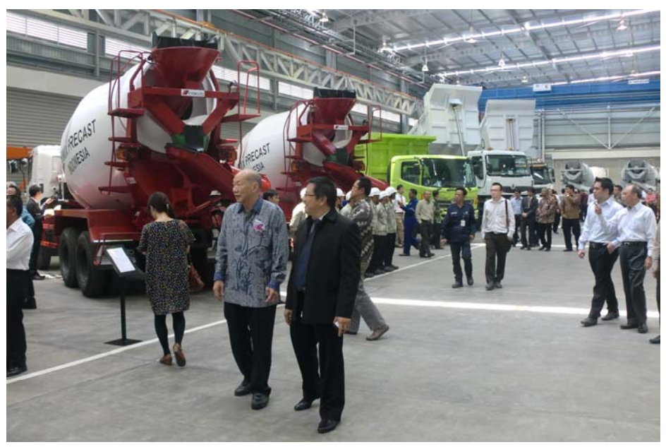
<<The photo of exhibiting our products to be manufactured and distributed by our plant and our joint venture company>>